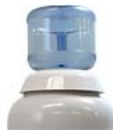
Living Water Ultra